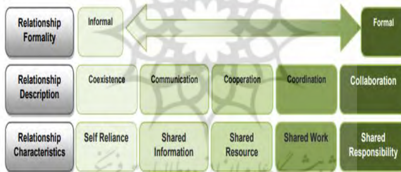
Figure (3): Border Management Approaches Based on Institutional Ties

collaborations between border authorities, private units and agencies, and border structures in neighboring countries. The primary objective of CBM is to overcome the paradox of security-development using a definitive and organized structure and conclusive rules and regulations with both internal and external functions, that ultimately take different forms based on environmental and human factors in the border regions (World Customs Organization; Polner,2011). To put CBM into practice requires less centralized policies and more support for local economic development. As observed by Razin (2000), a local government can help modify patterns of spatial development and overcome inequalities in any type of administration. CBM can tacitly solve social and cultural challenges arising out of the formation of a local government and help surmount the paradox of security-development in eastern border regions of the country.