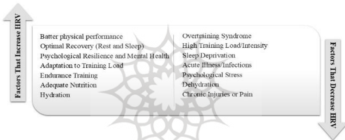
Figure 2. List factors affecting heart rate variability (HRV) monitoring in professional