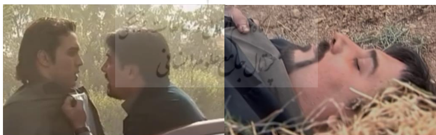
Figure 2. Argument between the brothers: a reinterpretation of the story of Adam's sons (Latifi 2006)

After committing the murder, Qābīl became distressed and fearful that others might discover his crime. God then sent a raven to teach him how to bury his brother's body. This part of the narrative is mirrored in Sahebdehan in a subtle yet artistically meaningful way. As Ramin lies motionless, Shahin gazes toward the sky, overwhelmed by uncertainty. Rather than a literal raven, the series employs the sound and flight of crows to symbolically reference the Qur'anic verse.