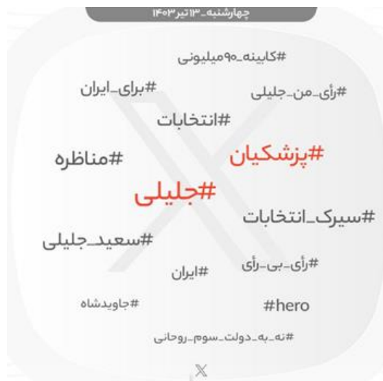
Figure 2. Most used hashtags

Notably, some prominent opposition figures took a firm stance against the election in the final days. It should be noted that there has not been a direct study examining the impact of the election boycott campaign on voter participation, especially in the first round. The chart below illustrates the volume of content produced on this subject. It appears that at the beginning of the electoral activities, the boycott-oriented factions, employing psychological operations tactics by avoiding election coverage, initially disregarded the issue. However, over time, the process of content production intensified and expanded significantly.