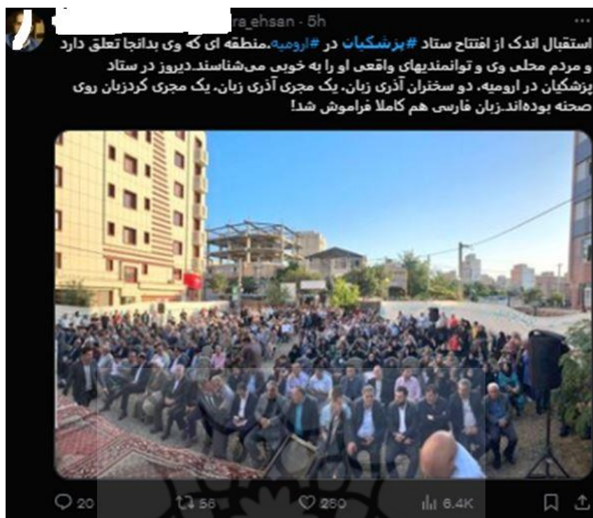
Figure 8. A sample Tweet