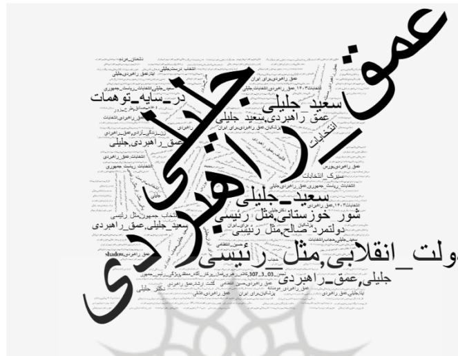
Figure 6. The most frequent hashtags for Saeed Jalili

By analyzing over 2,000 tweets published during the election period regarding Saeed Jalili, the most frequent hashtags and key terms have been identified.