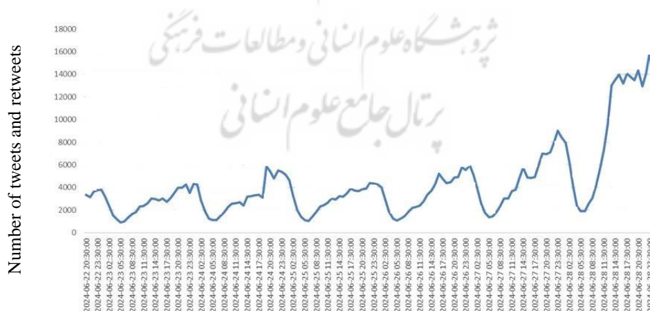
Figure 3. Number of tweets and retweets published with hashtags related to the election boycott until election day

Notably, some prominent opposition figures took a firm stance against the election in the final days. It should be noted that there has not been a direct study examining the impact of the election boycott campaign on voter participation, especially in the first round. The chart below illustrates the volume of content produced on this subject. It appears that at the beginning of the electoral activities, the boycott-oriented factions, employing psychological operations tactics by avoiding election coverage, initially disregarded the issue. However, over time, the process of content production intensified and expanded significantly.