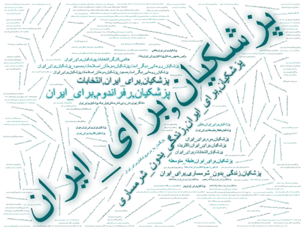
Figure 5. The hashtag cloud representing the hashtags used for the elected candidate