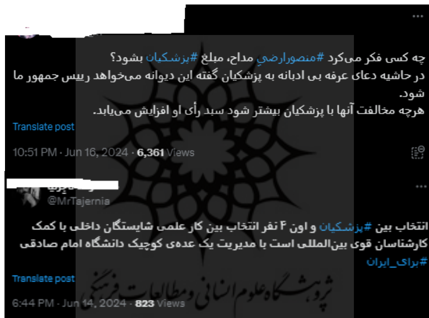
Figure 7. Sample Tweets

In this regard, it can be said that while many factors contribute to this polarization, the role of politicians in utilizing media to fuel and amplify these divisions cannot be underestimated. Politicians misuse various media platforms to initiate and sustain political polarization. They have found new ways to communicate directly with their voters. While this provides an opportunity for greater transparency and interaction, it has also become a breeding ground for misinformation, echo chambers, and confirmation bias. Politicians exploit the algorithmic nature of these platforms to target specific demographics, reinforcing pre-existing beliefs and ideologies, thereby deepening the divide between opposing political factions.