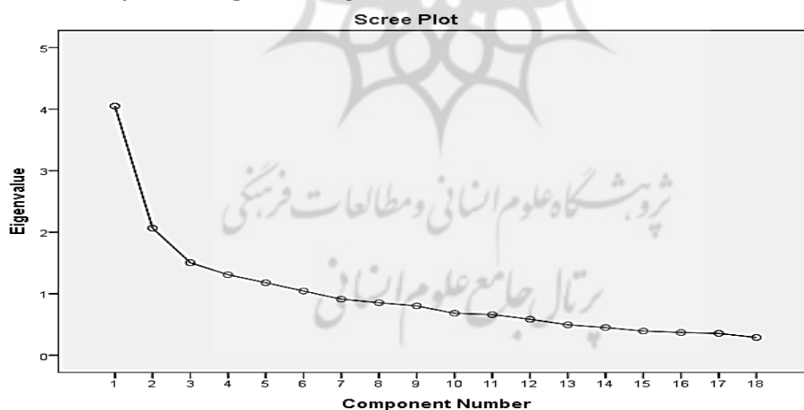
Figure 2 Scree Plot of the Component Eigenvalues

The Eigenvalues are visualized in the scree plot. The first six components have Eigenvalues over one which is considered strong factors. After that, component seven and onwards-the Eigenvalues drop off dramatically. The sharp drop between