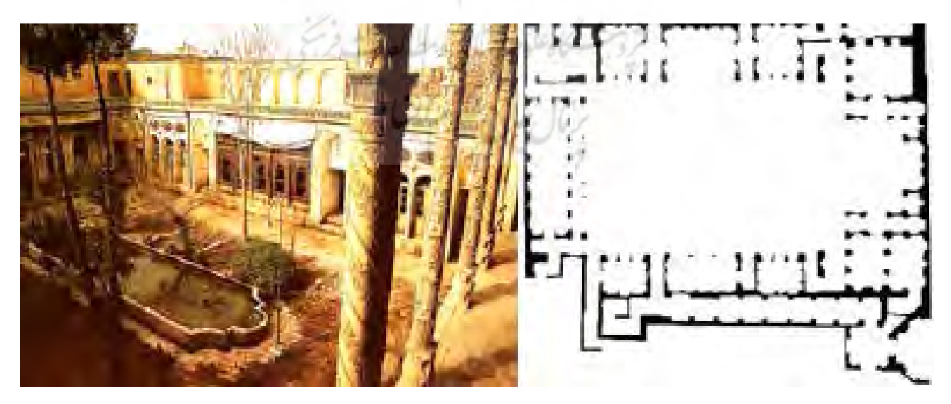
Fig 3. Dr. Alam's house plan and a picture of the introversion created in this house (Ganjnameh)

lic and private parts (Alam's house). Based on the dimensions and position of house, this privacy is observable by allocating one room to guests or having different gardens as well as Andaruni and Biruni parts. Each house usually has one garden with rooms around. On the other hand, the Armenian houses in Safavid dynasty privacy is not that important. Constructing the porch on the first floor and lack of gardens showing Andaruni and Biruni shows that privacy in jolfa is not observed that much. Multigarden houses have Andaruni, Biruni, Baharvand, Narenjestan, and Khalvat.