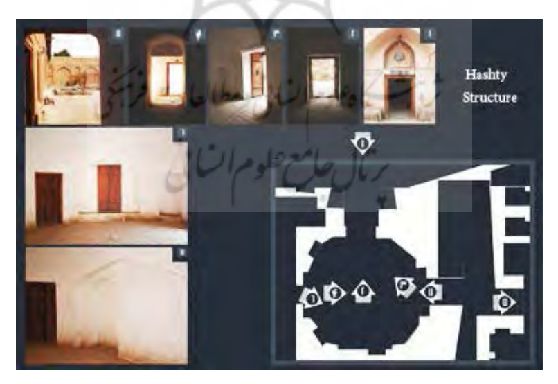
Fig 1.Entrance space at Sheikh al-Islam's house

The role of privacy in the culture and patterns of architecture describes the principle of the traditional and Islamic principles. Creating privacy in organizing entrance spaces while passing a hierarchy of entrance is highly important. Privacy has been always observed in building of the traditional architectures and it is expected that it be valued in the present architecture as well. By comparing two influential historic times on the architecture of traditional houses in Isfahan, some features have been found that effect on the degree of privacy. In our traditional architecture that have been some solutions for privacy (fig 1).