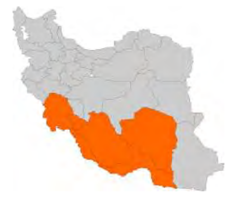
Figure 1. The study area of effective factors in the investment process by women entrepreneurs in the southern villages of the country using the three-pronged model

Table 4 mentioned the cities of Fars, Kerman, Hormozgan, Bushehr, Kohkiloyeh and Boyer Ahmad provinces and did not include the cities of provinces including Sistan and Baluchestan and Khuzestan, about which no agreement was reached. Figure 2 and table 4 depict the study area.