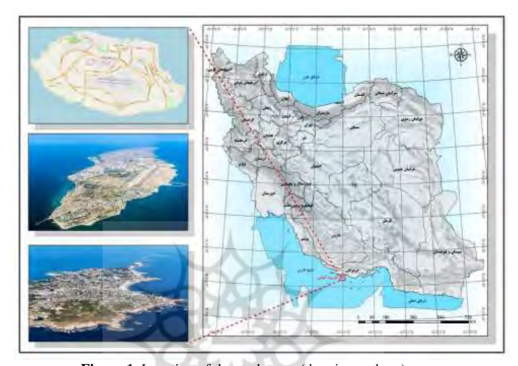
Figure 1. Location of the study area (drawing authors)

Research methodology this is descriptive-analytical and applied research that was conducted in the field using a questionnaire. In this study, research information was collected by two standard questionnaires, including the unique, exceptional, particular, extraordinary value of the green brand of sports tourists (Anselmisson et al.,2017; ) and the destination of sports tourism (Chow et al., 2016: ). The questionnaires used were: π The unique, particular, exceptional value of the green brand (Anselmisson et al.2017). This questionnaire has 20 items, and its purpose is to examine the unique, exceptional, particular, and extraordinary value of the brand, which has five components: awareness of the green brand, image of the green brand, perceived quality of the green brand, and perceived value of the green brand, And loyalty to the green brand is valued as a 5-point Likert scale (strongly agree, agree, have no opinion, disagree, strongly disagree). σ Sports tourism destination (Chow et al.: 2016): This questionnaire has 12 items, and aims to investigate the sports tourism destination, which is evaluated on a 5-point Likert scale (strongly agree, agree, have no opinion, disagree, strongly disagree). The research variables are: