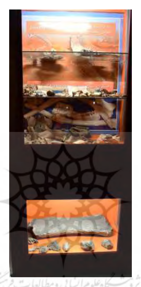
Fig 10. Lower jaw Giraffe (Miocene, Maragheh)