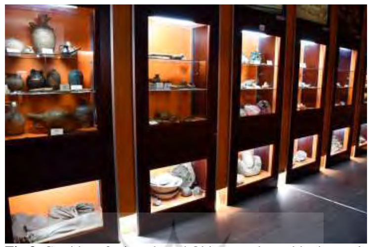
Fig 3. Corridor of minerals and Objects such as old mine tools