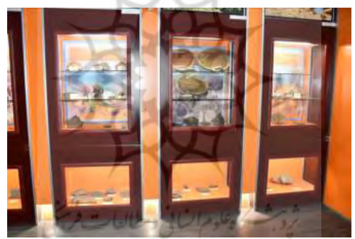
Fig 6. Invertebrate Fossils