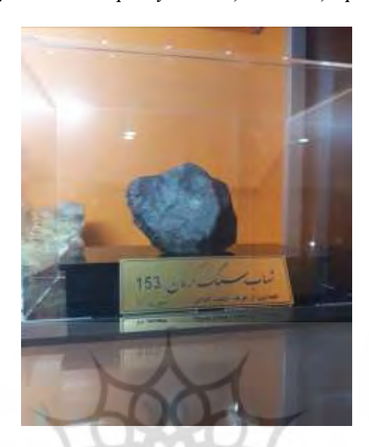
Fig 11. Kerman meteorite