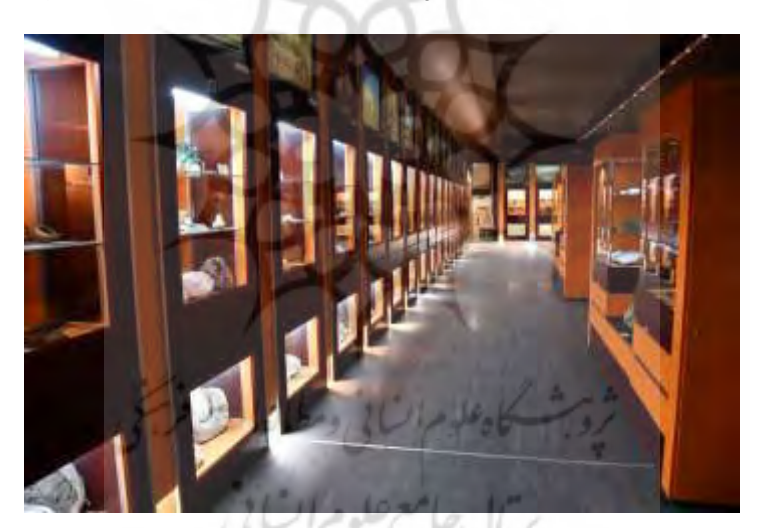
Fig 4. Fossil corridor, view from South to north