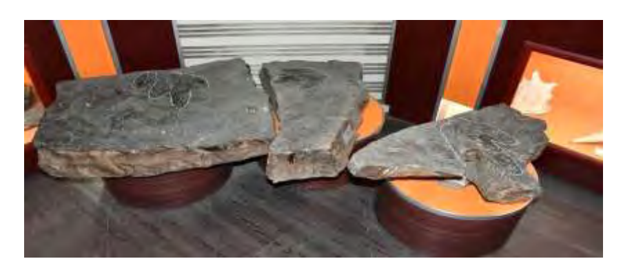
Fig 7. Dinosaur footprints (main slab)