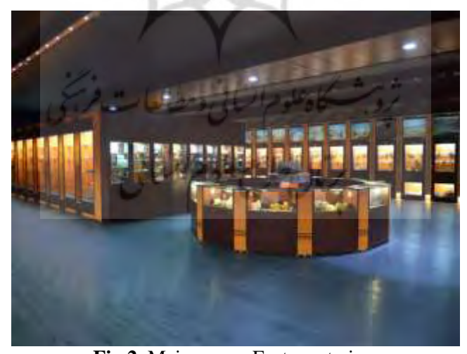
Fig 2. Main space, East-west view