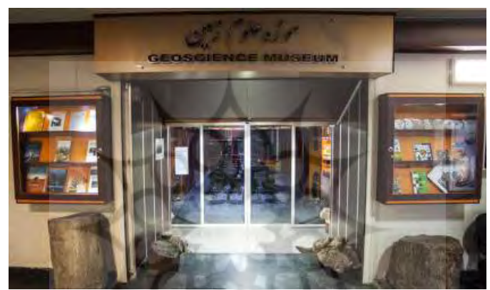
Fig 1. Geoscience Museum entrance

museums increase their tourism value also Dinosaur outcrops are hot spots of paleontological discoveries with tourism purposes. Cayla (2021) Due to this importance Dinosaur tourism, in general, is based on three types of paleontological remains: bones, Eggs or hatcheries, and footprints or trackways, the importance of the Museum of the Geological Survey is determined as a dinosaur geotourism. This footprint in the Museum of the Geological Survey of Iran is a paleontological heritage in fact this Ichnofossil is an incentive to start new research in the field of life of these mysterious creatures.