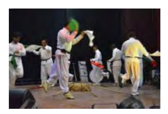
Figure 5. Folk dance in southern Kerman