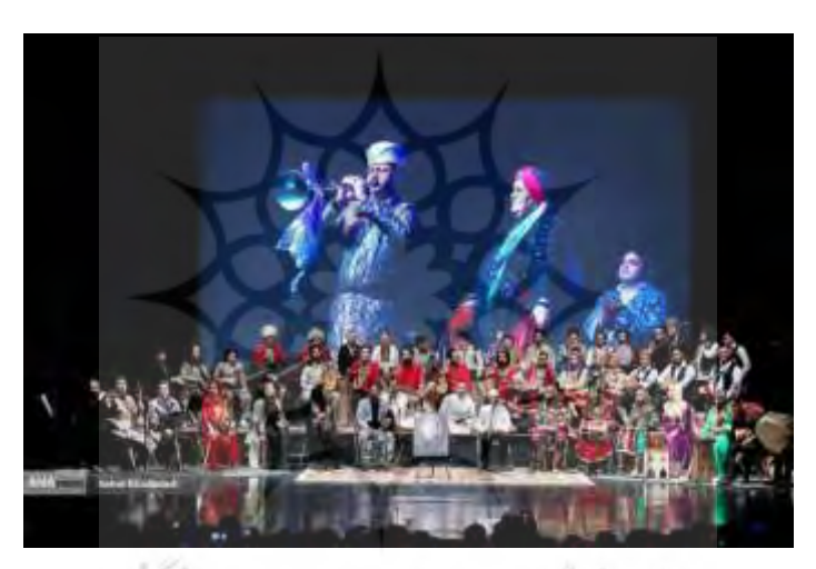
Figure 4. Folk music orchestra

As can be observed, the instruments used in Iranian music are of great variety, and each is used with a specific sound color in a solo group. In addition to the sound characteristics, Iranian musical instruments, as part of Iranian handicrafts, also have significant visual beauty. These features can provide many attractions for music audiences and attract many national and foreign tourists to different regions of Iran.