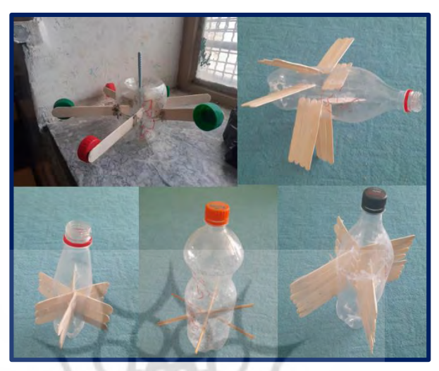
Fig 2. Examples of water wheels made by students

useful conversations were done in terms of characteristics of a good waterwheel and effective factors on the degree of done activity and its power. In the following, energy transformations were performed and the learners perceived these transformations more tangibly via Phet and ISLA simulations. In this regard, the role of engineering in more effective energy transformations during daily life and also, the STEM jobs such as bioenergy experts that are active in blended fields were discussed.