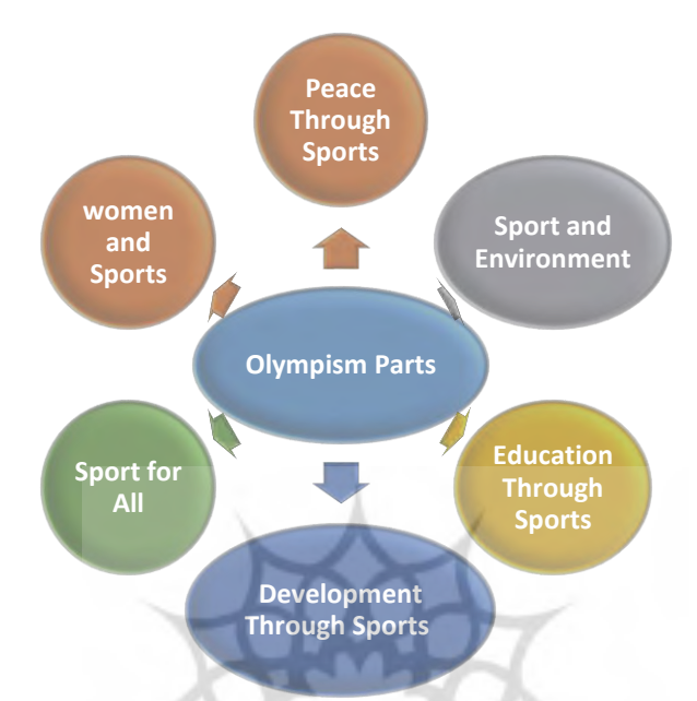
Figure 1. Olympism Parts (Feizabadi, Delgado, Khabiri, Sajjadi, & Alidoust, 2015)

Large sports communities such as the Olympics and the World Cup can bring countries together and lead to closer and more cordial relations between countries, in which case sports diplomacy works best and nations can show peace, friendship and cooperation. One of the goals of the Olympic movement is to be effective in ending international and political conflicts and promoting peace. Among the areas of Olympism (Fig. 1), peace through sport can be considered as one of its most widely used scenarios (Armour & Dagkas, 2012):