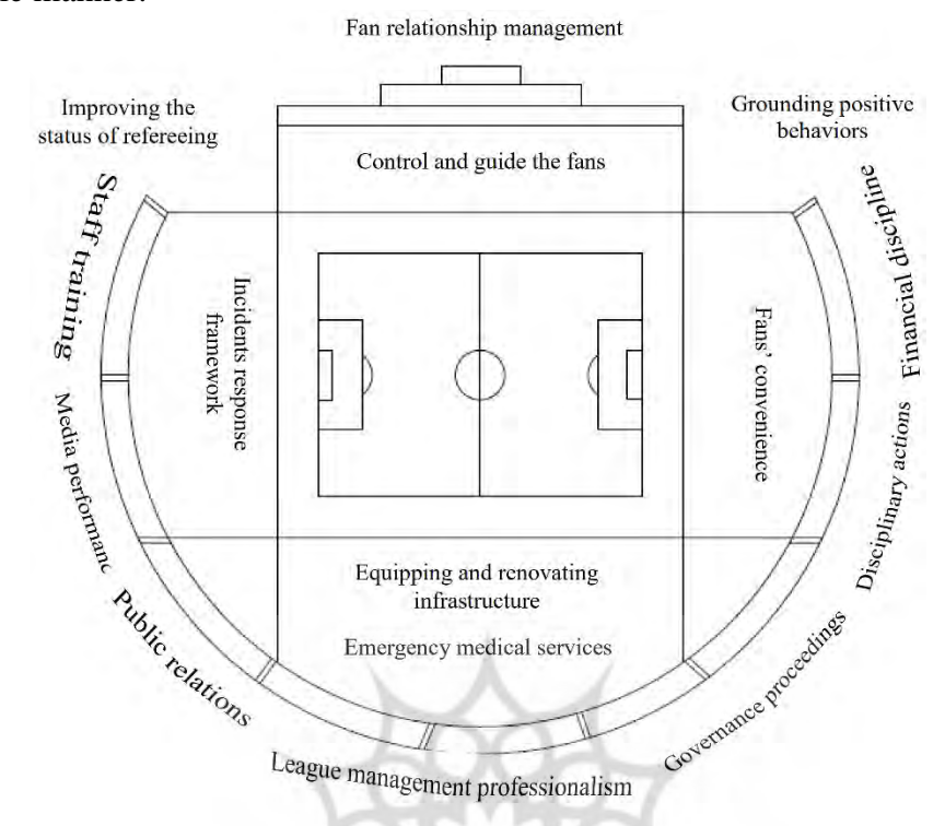
Figure 1. Solutions for CCM

Figure 1 illustrates the sub-themes of the two sections inside and outside the stadium in a more understandable manner.