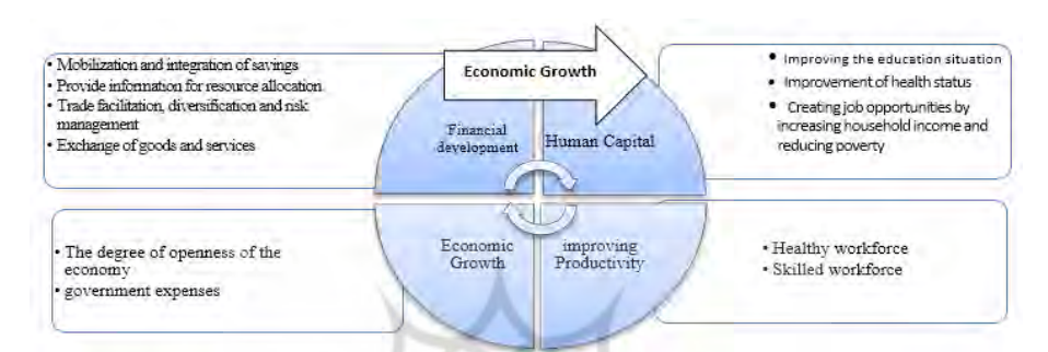
Figure 1. Channels of the effect of financial development on human capital (Aziz & Denvald, 2002)

based on a high standard of living, good health, low mortality, and a high quality of education as well as education coverage (United Nations Development Program [UNDP], 2018). Aziz and Denvald, (2002), stated three methods of influencing financial development on economic growth as follows: 1- Financial development reduces the final production capital of by collecting information to evaluate alternative investment projects and reduce risk. 2- By creating proportionality