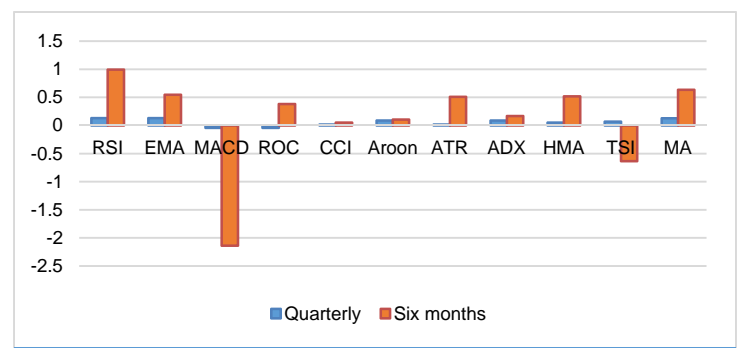
Fig 3. Average returns on 11 indicators in the quarterly and six-month periods