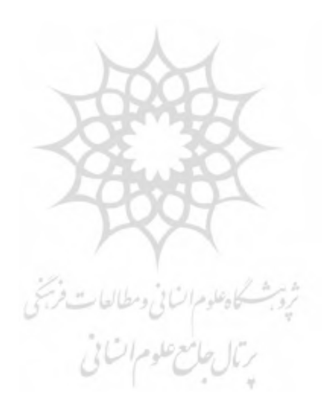
This Page is Intentionally Left Blank.