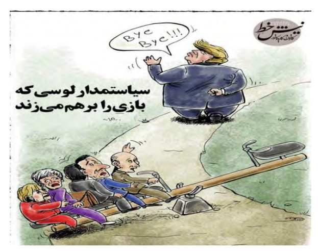
Figure 4. [A Spoiled Politian Spoils the Game], Nishkhand, 13 May, 2018.