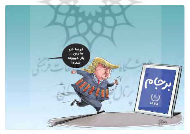
Figure 2. [Trump's Terrorist Attack on the JCPOA], Fars News Agency, May 24, 2018

Another similar cartoon, figure 2, depicts Trump running uncontrollably toward a sign holder with the JCPOA and IAEA written on that, with TNT around his waist and ready to explode himself. An unknown figure is shouting, "bring his pills...he has gone crazy again".