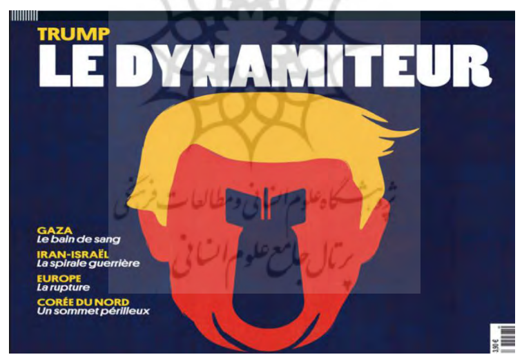
Figure 7. "Trump Le Dynamiteur" [Trump the Dynamiter], Courrier international, May 17, 2018.

Trump's Bellicose: The French vision of Trump's bellicosity has been reflected in cartoons attributing warlike characteristics to the current US president. On cover of the Courrier International, Trump's face, sketched by a drawing, recognizable by blond hair, is masked in the middle by a bomb thrown; which seems to be by an airplane. Arrangement of the bomb gives a particular effect to drawing with an upper part of the bomb having two "wings" conform to places where the eyes should always be, and are closed to lower part of this bomb constituting nose of the character. A big nose staged by a bomb recalls famous story of Pinocchio and his nose which becomes long when he indulges in lies. This arrangement of the bomb on this face also gives an impression of a clown face, involving a virulent criticism towards Trump who is designated as a dynamiter [le dynamiteur] by the title.