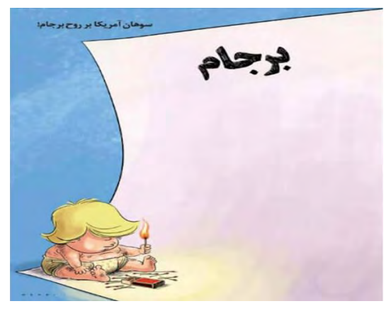
Figure 1. [US Polishes the JCPOA's Spirit], Shargh News Agency, June, 2, 2018

Another similar cartoon, figure 2, depicts Trump running uncontrollably toward a sign holder with the JCPOA and IAEA written on that, with TNT around his waist and ready to explode himself. An unknown figure is shouting, "bring his pills...he has gone crazy again".