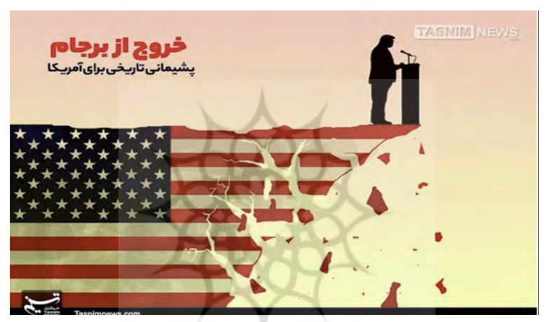
Figure 3. [Abandoning the JCPOA: A Historical Regret for the United States], Tasnim News Agency, May 8, 2018

US Shot Itself in the Foot: Another major framing of Trump's unilateral withdrawal from the JCPOA in Iranian newspapers, is representing Trump and by an extension the United States as the party that has deprived itself from the benefits of the JCPOA. The cartoon depicts Trump's podium on the verge of collapse and the US flag (as a symbol of American integrity and identity) being shattered. Similar cartons in Fars, Mashregh, Khorasannews and donya-e-eghtesad are published on the Americans as the major loser of Iran deal withdrawal.