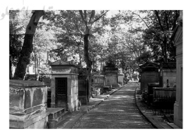
Fig. 3: Scenes from Père Lachaise Cemetery in Paris