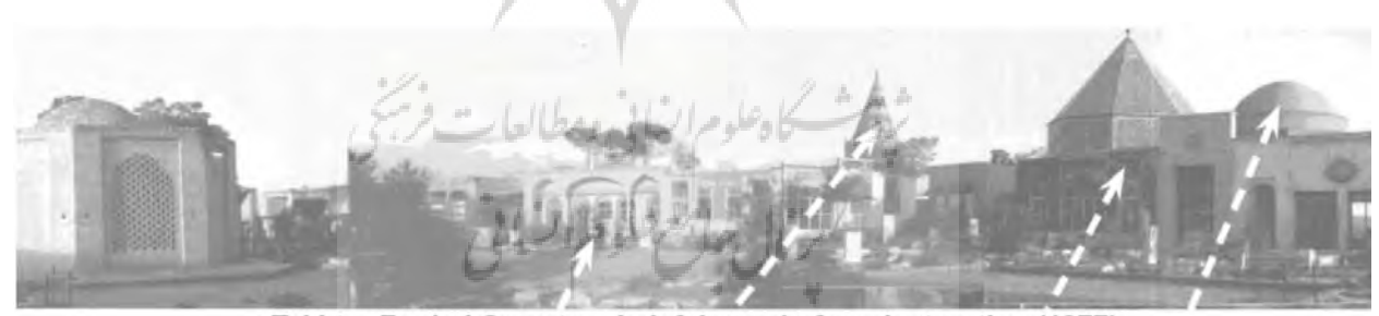
Takht-e-Foulad Cemetery in Isfahan – before destruction (1977)