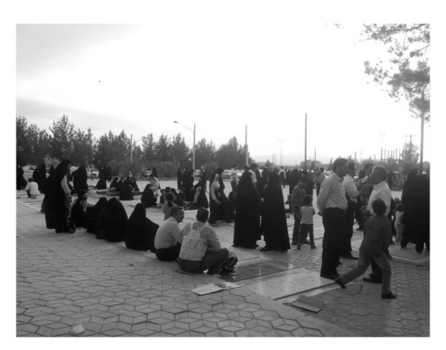
Fig. 2: Scenes from social interaction of citizens in cemetery (Cemetery of Ardakan, Yazd, Iran)