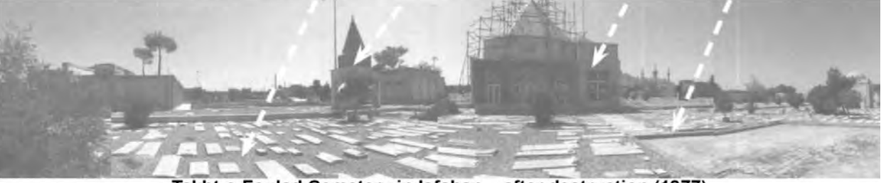
Takht-e-Foulad Cemetery in Isfahan – after destruction (1977)