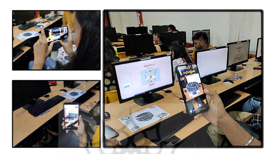
Figure 2. Respondents experiencing AR presentation following their MOOC experience

The class has been asked to see the MOOC video on their mobile phones first. The respondents did not have any restrictions on the number of times the video can be seen. Once all the respondents were done watching the course, they filled the questionnaire.