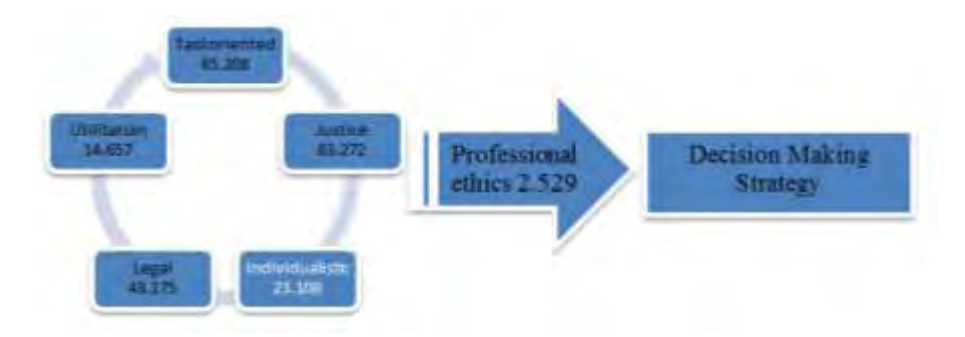
Fig. 3. Results of SEM fitness and the absolute t-values of paths