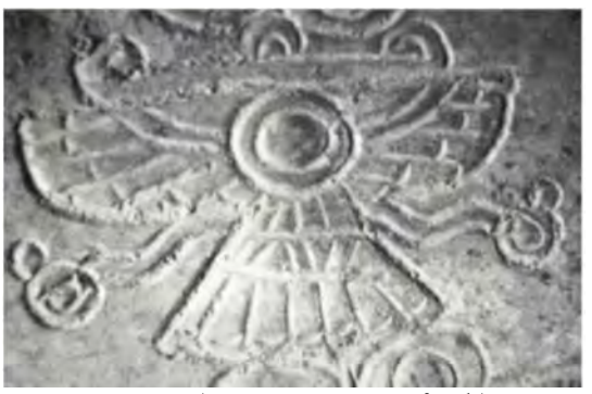
Fig. 4a. (Bonacossi, 1995, fig. b)