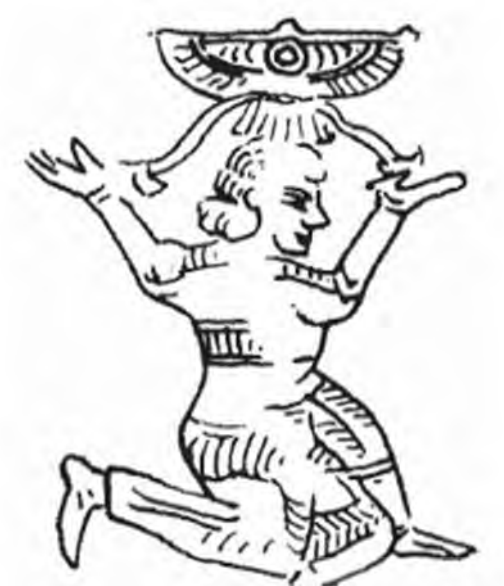
Fig. 5a. (Kendall, fig. 14a)

function has been affected by Mesopotamian Šamaš, the sinners' punisher.