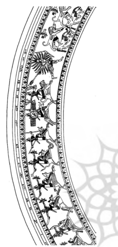
Fig. 2. (Çilingiroğlu, 2004: 268-269)

2012). Comparing to Šamaš, the sun (Fig. 3) and the winged disc (Fig. 4a-b) were Šiwini's main symbols as well. There is a rather unusual demonstration of the sun discs in the hands of a kneeling facing right beardless man or deity as well (Figs. 5a-b).