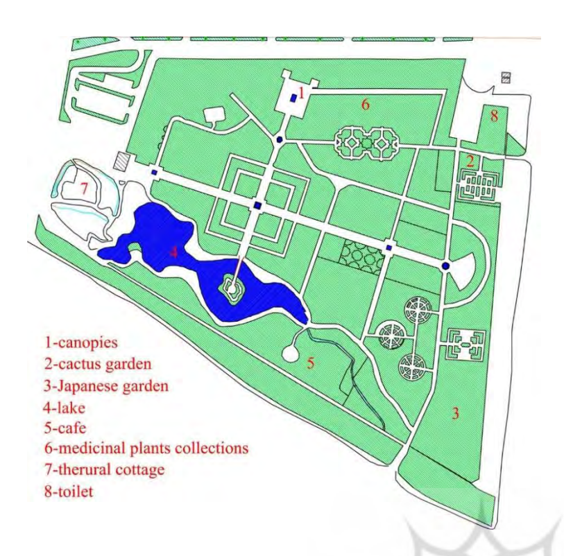
Figure 3. The Complete Map of The Flower Garden located in Isfahan, Iran, designed based on Google Map by Soleimanpour (2016) September 5.