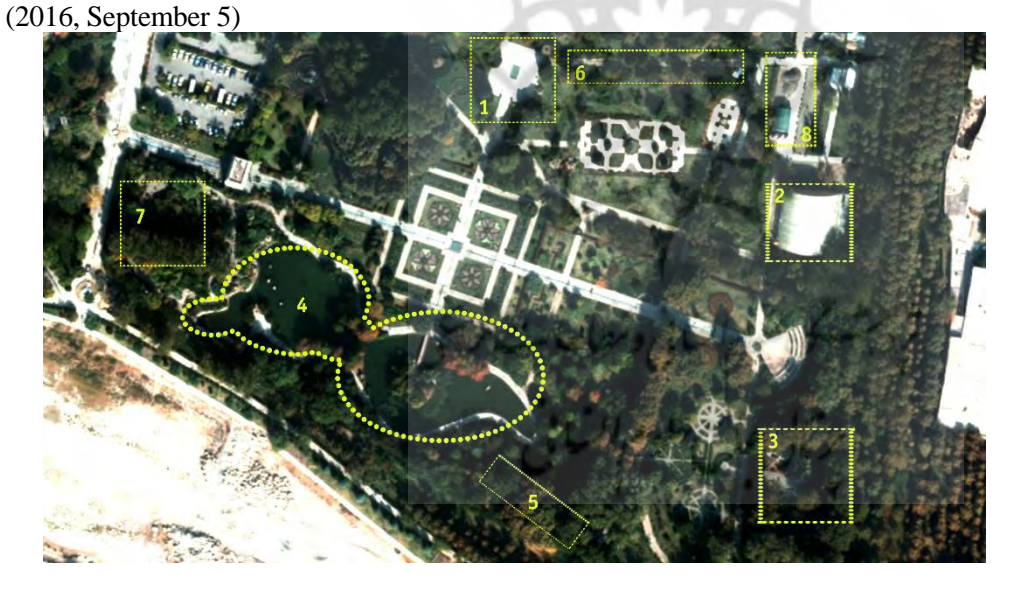
Figure 4. Aerial Photo of Flowers Garden.

(1. Canopies, 2. Cactus Garden, 3. Japanese Garden, 4. Lace, 5. Cafe, 6. Medicinal Plants Collections, 7. Rural cottage, 8. Toilet)