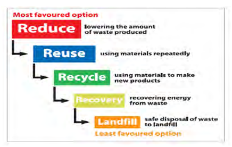
Figure 2. Waste Hierarchy (Waste Aware Business, 2009)

The most favored option being a waste reduction (waste prevention and minimization). The least favored choice is sending wastes to landfills. Solid waste segregation technique which individuals to segregate wastes at the source of generation is also an important technique that should be developed in individuals in other to attain effective management of wastes. Solid waste disposal methods which are most preferred and considered as environmentally friendly in waste management business are incineration. composting, dumping in approved dumpsites and landfilling. However, littering, open dumping of solid wastes which are practiced by many individuals are not environmentally friendly because they aid in the spreading of diseases and the pollution of the environment (Waste Aware Business, 2009).