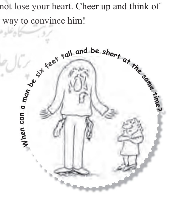
When he is short of money!!